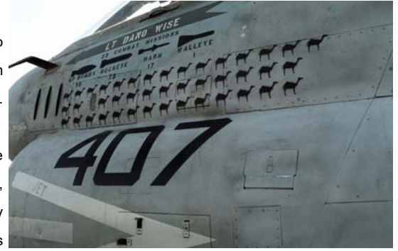
A U.S. Navy pilot's stats marked on the side of his attack aircraft while deployed in support of Operation Desert Storm. They show combat missions flown, missiles launched, and bombs dropped.

On Jan. 16, 1991, at 7 p.m. Eastern, President George H. W. Bush announced to the country that the liberation of Kuwait had begun. The offensive action against Iraq, codenamed Operation Desert Storm is carried out under provisions of twelve U.N. Security Council resolutions and resolutions of both houses of the U.S. Congress. Combat Operations last through the end of February. Forward deployed naval forces provided protection for early introduction of land-based ground and air assets, and may well have deterred further aggression by Iraq. Maritime superiority and unchallenged control of the sea enabled the safe and timely delivery of equipment, supplies and spare parts necessary to support the allied campaign. Naval aviation complemented allied air operations, added flexibility to the air campaign and deterred reintroduction of Iraqi aircraft from Iran into the conflict while Tomahawk cruise missiles took out heavily defended targets in Iraq and significantly degraded enemy air defenses.