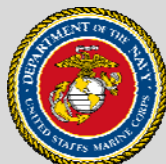
U.S. Marine Corps